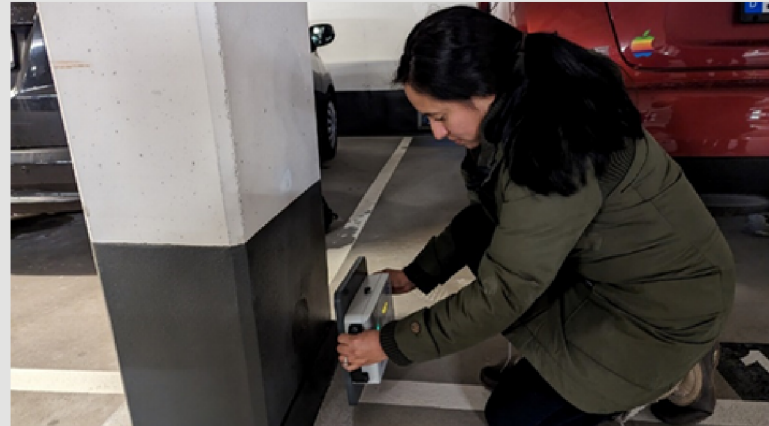
Figure 4. Handheld data collection gateway

Additionally, data analysis can provide valuable insights into the environmental conditions that contribute to corrosion such as moisture intrusion, aiding in the development of targeted preventive measures.