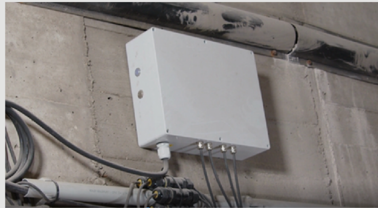
Figure 3. Fixed data collection gateway

The enormous amount of data collected from wireless sensors necessitates advanced data analysis techniques. Data analysis algorithms, such as machine learning and statistical modeling, can identify patterns and correlations within the sensor data. By employing anomaly detection algorithms, engineers can pinpoint structural hotspots where corrosion is occurring.