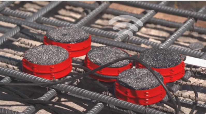
Figure 2. Embedded corrosion sensors

Gateways can be permanently fixed to the structure, or they can be handheld devices used by the structural engineer during inspections. With fixed gateways, data collection is continuous and automated and does not rely on manual inspections. Embedded sensors require no batteries, so they will last over 80 years in the structure.